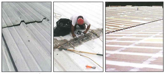
Fix wind lift & poor repairs; seal all seams