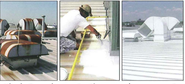
Flash & seal penetrations, curbs, parapets