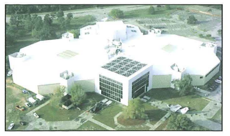
Tear-off and replacement of this EPDM museum roof was to take 4 months plus facility disruptions. ASTEC<sup>®</sup> Re-Ply<sup>™</sup> installation took 6 weeks with no disposal or interruption headaches for less than half the cost.