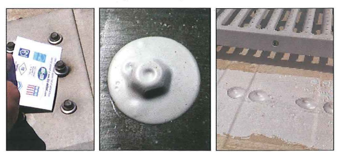
Tighten & seal loose & missing fasteners