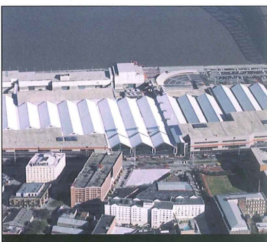
Hurricane Katrina survivor