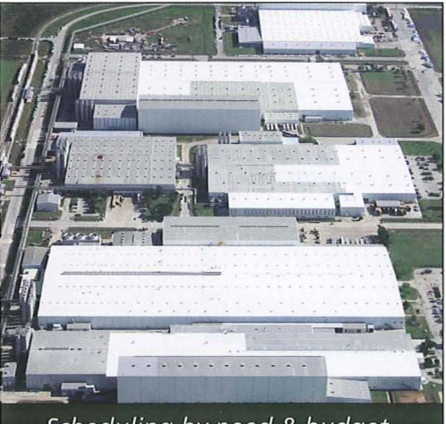
Scheduling by need & budget

The complex metal roof problems at this high-end car dealership required the expertise of an ASTEC® Authorized Contractor. Attention to all details from inspection to preparation to finish led to a win-win: no business or inventory disruptions, and a sustainable new roof.