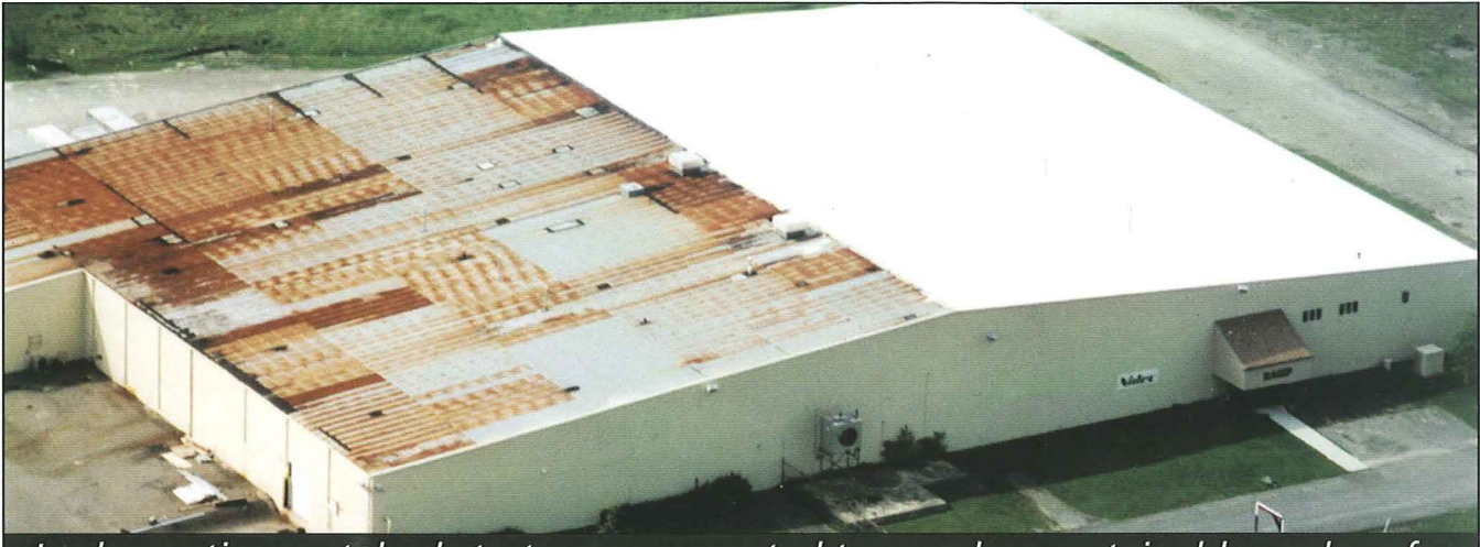
Leaky, rusting metal substrates are converted to seamless, sustainable cool roofs.

With hundreds of millions of square feet applied since 1986, ISO 9001 Registration, multiple accreditations, and the highest quality materials... ASTEC is the right choice.