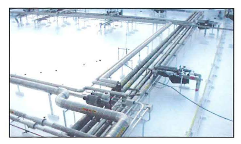
This asphalt roof with multiple supports and penetrations was a costly nightmare for traditional roof replacement, but was efficiently reroofed with a seamless, fluid-applied ASTEC<sup>®</sup> Re-Ply<sup>™</sup> System.

Get a free inspection survey of your roof. You, too, could be saving thousands of dollars.