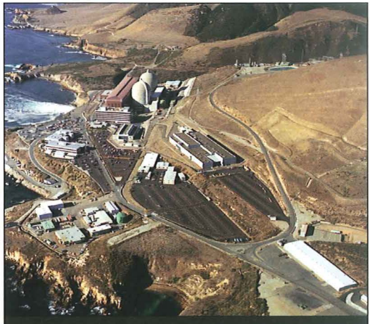
Nuclear complex in salt mist

An ASTEC<sup>®</sup> Re-Ply<sup>™</sup> roof conversion can be half the price of replacing a roof, without disposal or downtime expenses. Converting an existing metal substrate can be viewed as a maintenance expense, or as a capital expenditure. There are often additional "Green" building incentives for cool roofing.